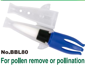
No. BBL80 For pollen remove or pollination