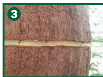
3 Girdle completed.