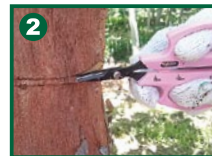
2 By using shears remove the bark.