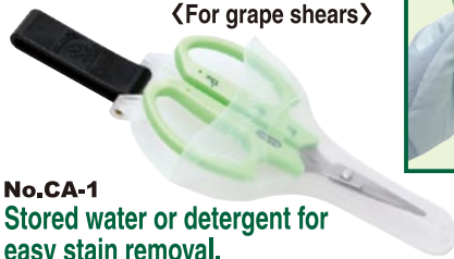
No. CA-1 Stored water or detergent for easy stain removal.