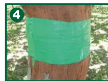
4 Tape over the groove and protect the cambium layer.