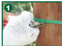
1 Place tape on girdling position and cut the bark along.

※ Caution: This tool harm trees, please use upon fully understand attentions on the instruction.