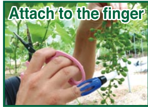
No. L62 Replacement brush